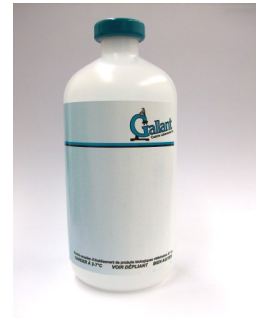
CHECK OUT THE NEW IMAGE!

Gallant also offers diagnostic services, to broaden the understanding of the organisms impacting the herd or flock.